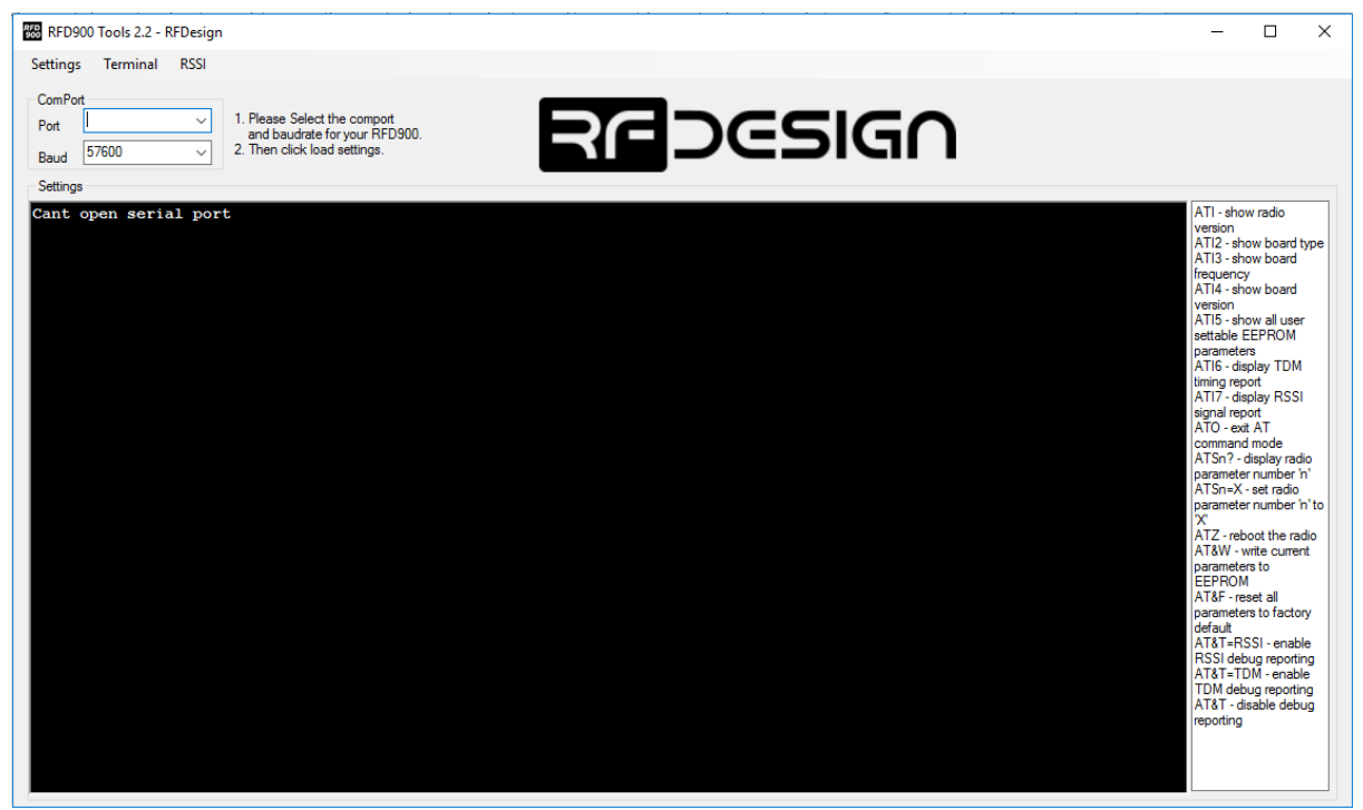
Figure 2-2 RF Design Tools Terminal Screenshot

Terminal: this mode allows the user to connect to the modem through a terminal allowing settings to be modified with AT commands. Some of the basic commands are shown to the right of the terminal. The particular commands for modem settings can be found in the user manual appropriate to the firmware in use