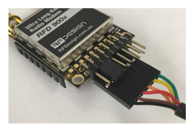
Figure 3-1: An FTDI cable connected to the RFD900x modem

When using the FTDI cable to connect to the modem through a COM port requires that the cable be connected with the black wire of the FTDI (pin 1) connect to pin 1 on the modem as shown in Figure 3-1.